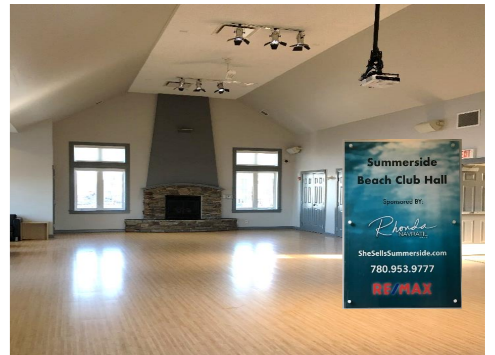
Example of sponsor sign displayed on the right

The Summerside Beach Club Hall is one of the most sought after venues of the Summerside Residents Association. Home to both programs and rentals, the hall is booked for over 800 functions and classes each year, and we receive several phone inquiries per day. The Sponsor's name will be included in the name of the hall and referred to in all correspondence. Our hall overlooks our beautiful 32 acre lake. Currently sponsored until July 2025