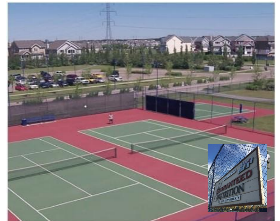
Example of sponsor sign displayed on the right

Residents can enjoy tennis while playing on the courts named after your organization! Two tennis courts and a practice court are available to residents each summer. The naming sign is located in one of the most visible and high traffic areas of the park. Currently sponsored until April 2026